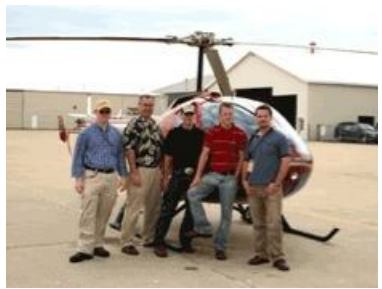
Aviation Camp 2007