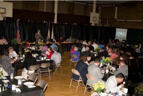
Alumni Banquet 2009

Both Dorms and Housing have a monthly rent of $250.00.