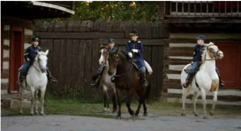
Scene from "Ghost Riders in the Van" Produced by IFBC Film Studio www.ghostridersinthevan.com