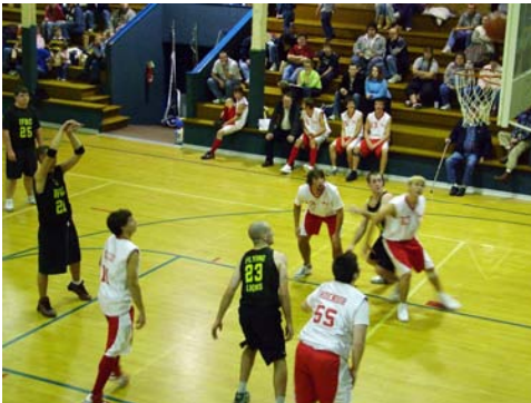
IFBC Flying Lions Basketball Game