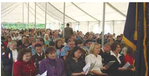
GBBC special meeting under the Big Tent