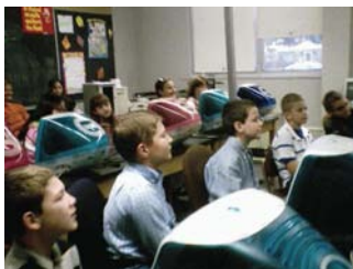
Indiana Home School Support computer Class

This is a course on child development and learning, including a perusal of various curriculums and their applications. Audiovisuals, games, and other progressive learning tools will be explored and experienced. Opportunities for hands-on experience in different educational environments will be available.