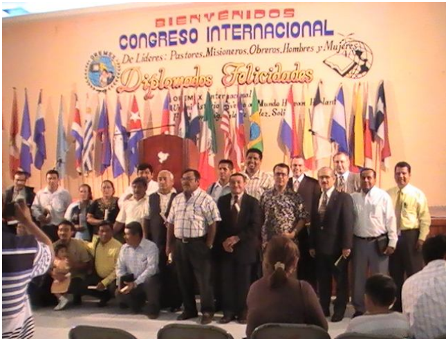
Graduation ceremony for IFBC/OREMEX graduates Cancun, Mexico 2009

Students seeking a degree have the opportunity to spend one week with one of our sponsored missionaries in our Mission to Missionaries program. Spring Break is an optimal time to take advantage of this program.