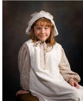
Academy of Arts Drama Camp

This course will instruct how missionaries use the world alphabet to create and teach a written language to those that only have an oral language.