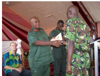
Chaplain receiving IFBC certificate for pre-basic chaplain program