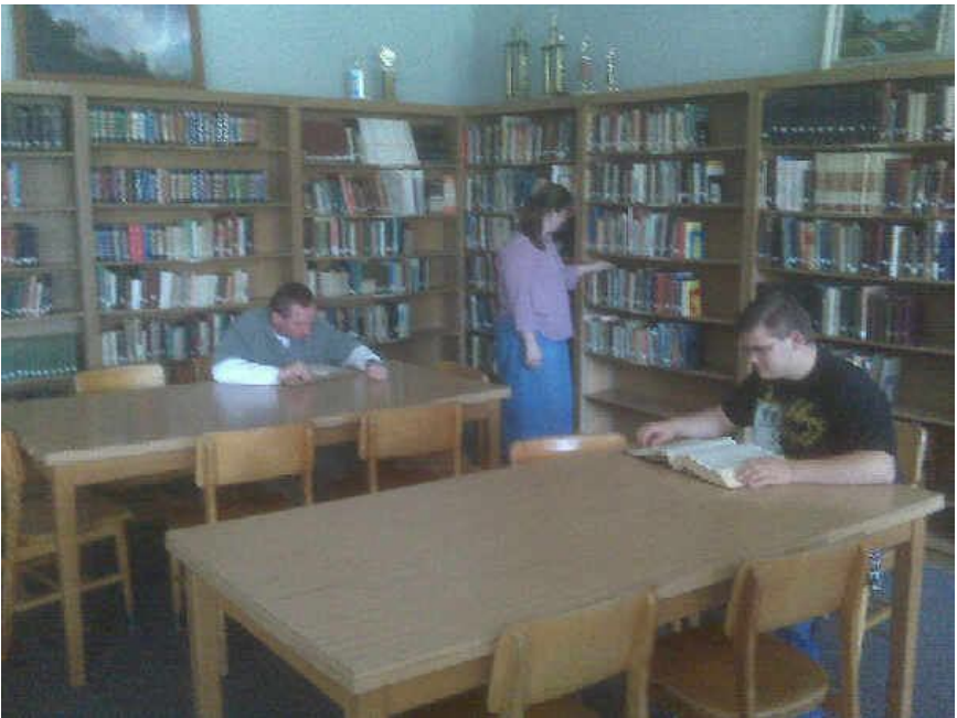
Dr. David R. Haifley Memorial Library

The library is open to the students with over 8,000 books to use for research and study.