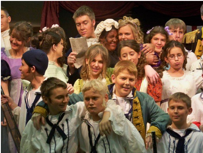
Academy of Arts Cast 2010