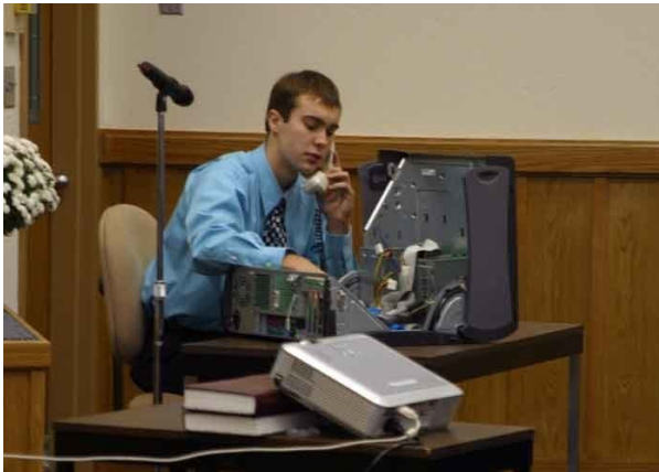
Computer Tech skit at Operation Teens Youth Conference