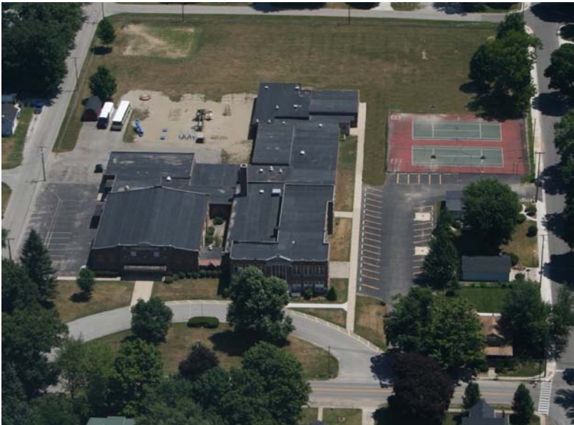
Arial view of the IFBC Campus

The Campus is located 45 Minutes North West of Fort Wayne, three hours East of Chicago, three hours north of Indianapolis, three and one half hours south west of Detroit, and 47 hours from . . . ZAMBIA.