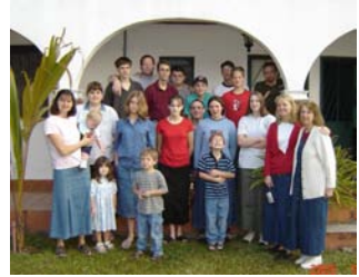
O T Abroad Missions Trip

And the things that thou hast heard of me among many witnesses, the same commit thou to faithful men, who shall be able to teach others also. II Timothy 2:2