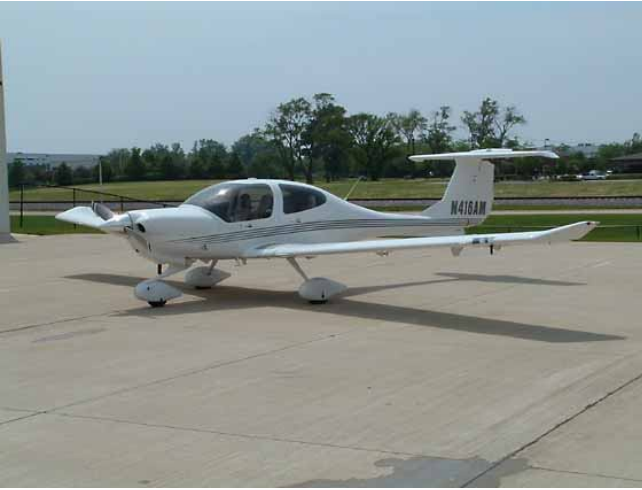
Aviation Camp 2007