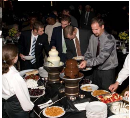
Enjoying the chocolate fountain