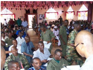
IFBC Chaplain Training in Sierra Leone