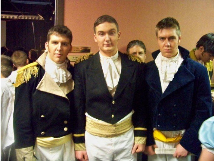
Drama Camp 2010