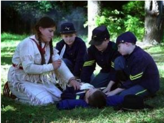
Scene from IFBC Film Studio's movie project "Ghost Riders in the Van"