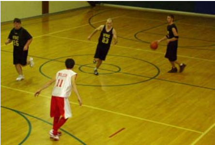
IFBC Flying Lions Basketball Game