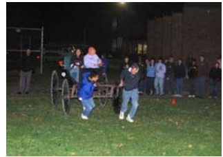
Youth Conference fun

And that they may recover themselves out of the snare of the devil, who are taken captive by him at his will. II Timothy 2:24-26