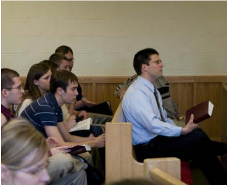
IFBC Chapel Service